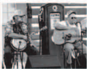
THE MORON BROTHERS (Saturday, 23rd)

CONCESSIONS & HOT FOOD Camper Hook-ups (Water & Electric) For Camping Call: (386) 328-1281 Official Bluegrass Motels: Quality Inn & Suites (386) 328-3481 Crystal Cove Resort (386) 325-1055 Sleep Inn & Suites (386) 325-8889 Ask for Special Bluegrass Rates AT ALL MOTELS.