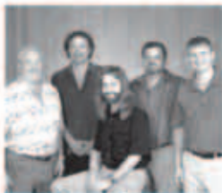
NOTHIN' FANCY (Thursday, 21st)