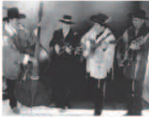
GOLDWING EXPRESS (Friday, 22nd)