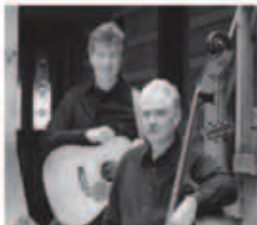
THE CROWE BROTHERS (Thursday, 21st)