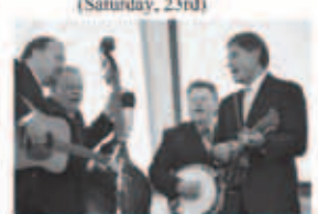
DRY BRANCH FIRE SQUAD (Friday & Saturday 22nd & 23rd)