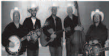
THE BLUEGRASS BROTHERS (Thursday, 21st)