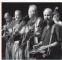
THE SELDOM SCENE (Friday, 22nd)