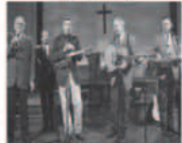
THE MARKSMEN SPBGMA - 7 Time Bluegrass Gospel Group of the Year CGMG - 4 Time Country Gospel Quartet of the Year (Friday, 22nd)