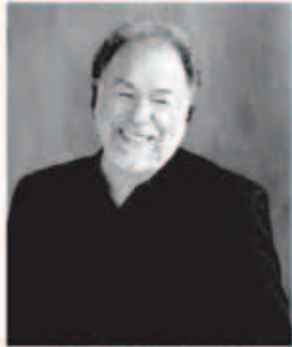
GENE WATSON & The Farewell Party Band (Saturday, 23rd)

380 BOYS' RANCH ROAD PALATKA, FLORIDA 32177 (10 MILES S. FROM PALATKA ON STATE ROUTE 19)