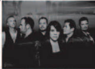
THE GRASCALS "IBMA Entertainer of the Year 2006-2007" (Thursday, 21st)